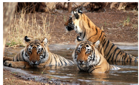
Khangchendzonga National Park