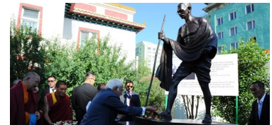
VP unveils the statue of Mahatma Gandhi