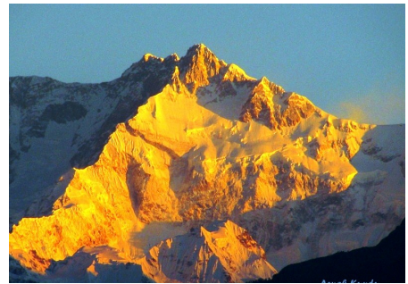
Sunrise at Mt. Khangchendzonga viewed from Pelling