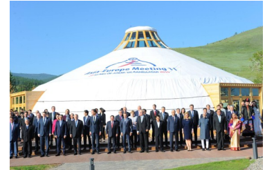
Leaders at the ASEM Summit

Heads of State/Government/Representatives of 51 Asian and European countries, the High Representative of the European Union and the ASEAN Secretary General participated in the Summit.