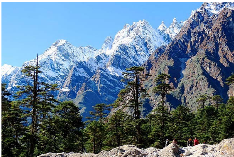
Khangchendzonga National Park